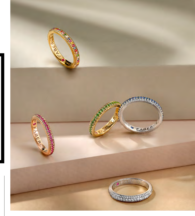
Image: Fabergé Fluted Bands featuring Gemfields' Mozambican rubies, sapphires, diamonds, tsavorites and multicoloured gemstones.

During the same period, Fabergé recorded an EBITDA (earnings before interest, tax, depreciation and amortisation) loss of US$2.9 million, compared with US$2.5 million in 2018, with average monthly operating expenses of US$0.8 million and a sales margin of 45% (six months to 30 June 2018: 40%).