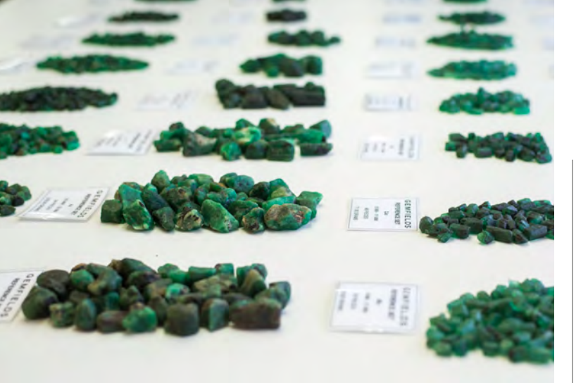
Image: Gemfields' propriatory grading system for emeralds at Kagem mine in Zambia.