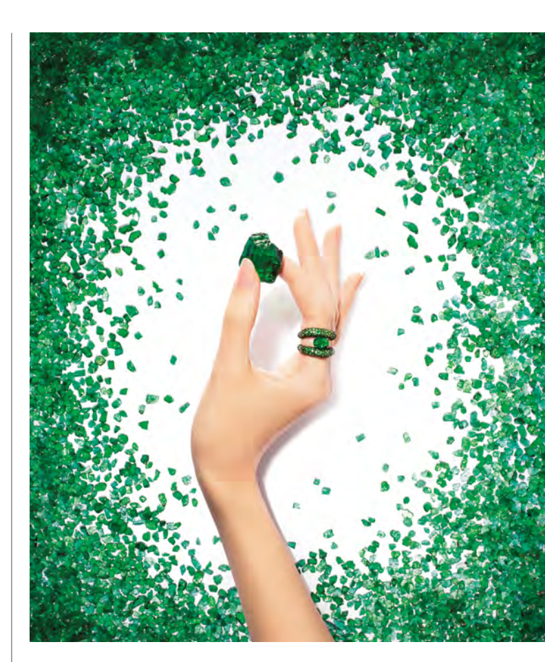
Image: Faberge Emotion Charmeuse Ring featuring an oval Gemfields' Zambian emerald centre gemstone and over 300 round, pavé-set emeralds, surrounded by rough Zambian emeralds from Kagem mine.

Selling, general and administrative expenses ("SG&A"), excluding impairment charges, were US$22.8 million compared with